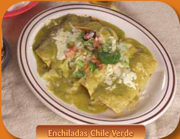
Enchiladas Chile Verde