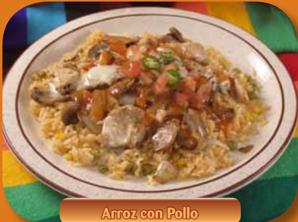
Arroz con Pollo