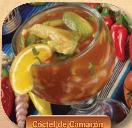
Cóctel de Camarón

Fresh vegetables sautéed in a special recipe, then delivered sizzling hot over a bed of sautéed onions and green peppers. Served with pico de gallo – 8.95