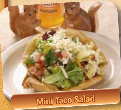
Mini Taco Salad

Corn tortilla chips smothered with your choice of white or yellow shredded cheese and served with beef or chicken. Small serving of lettuce upon request. Little Amigos Nachos are not spicy - 3.95