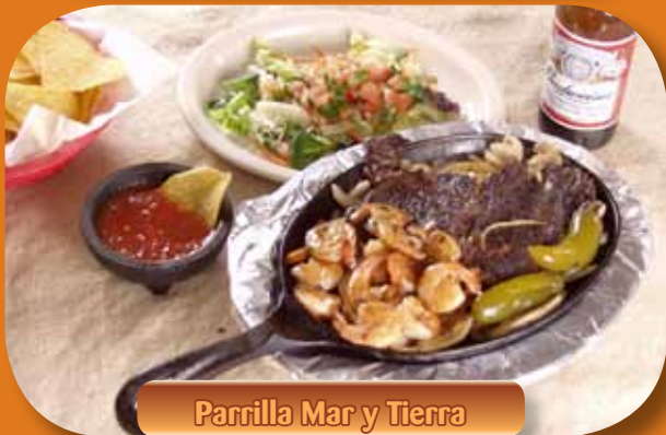
Parrilla Mar y Tierra