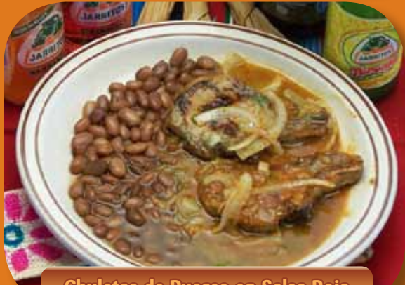
Chuletas de Puerco en Salsa Roja