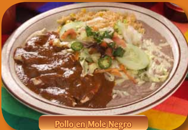
Pollo en Mole Negro