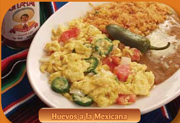
Huevos a la Mexicana