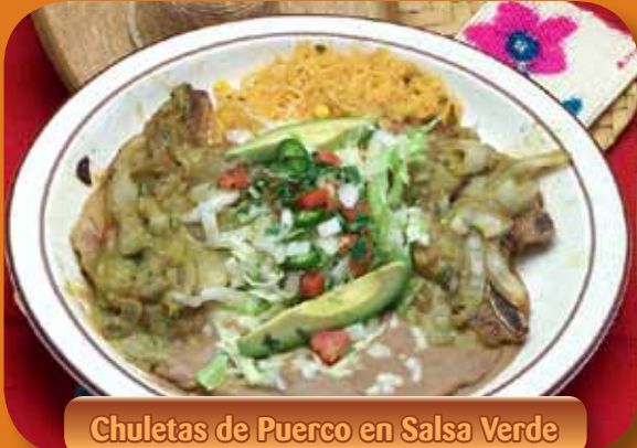
Chuletas de Puerco en Salsa Verde