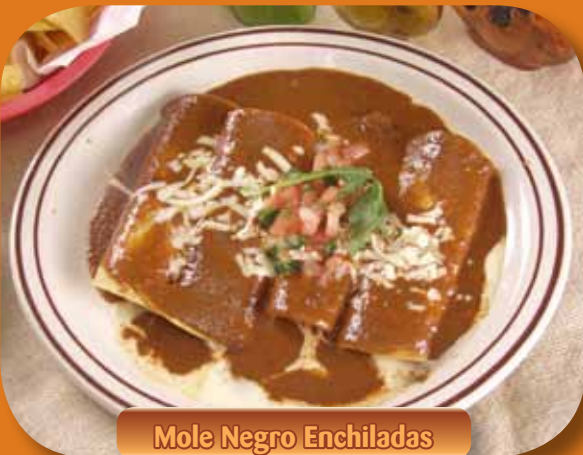
Mole Negro Enchiladas