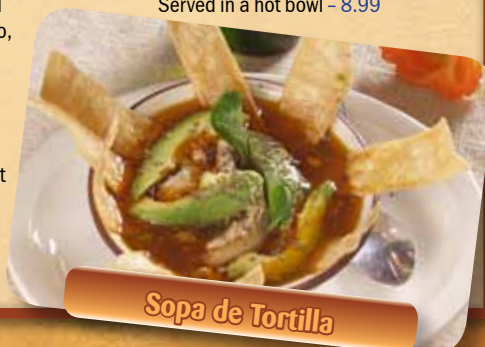
Sopa de Tortilla

Shrimp cooked in their own broth with mixed vegetables, mild sauce and tortillas. Served in a hot bowl – 8.99