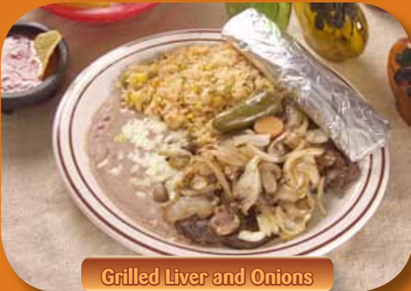
Grilled Liver and Onions