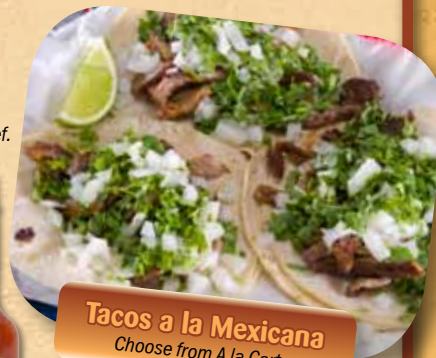
Tacos a la Mexicana Choose from A la Carte