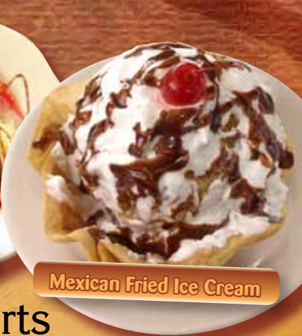
Mexican Fried Ice Cream