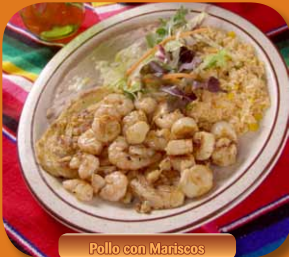
Pollo con Mariscos