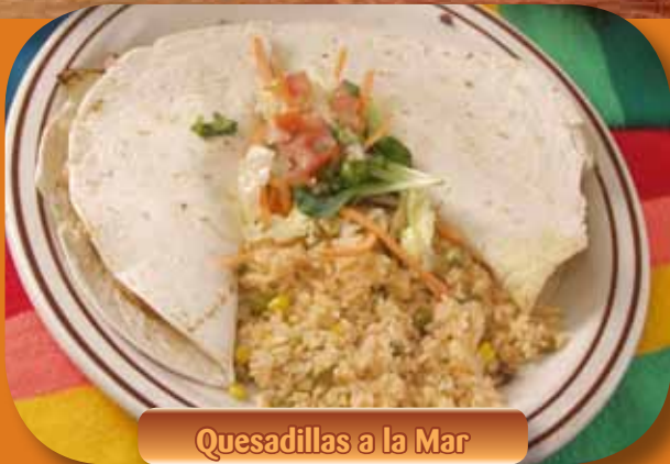
Quesadillas a la Mar